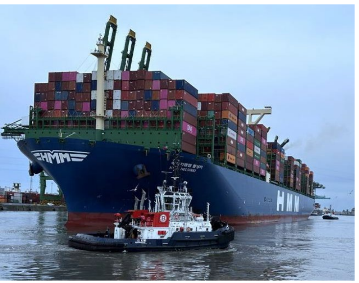
Boluda's VB Kiwi & VB Eagle assisting HMM Helsinki to Antwerp PSA Terminal