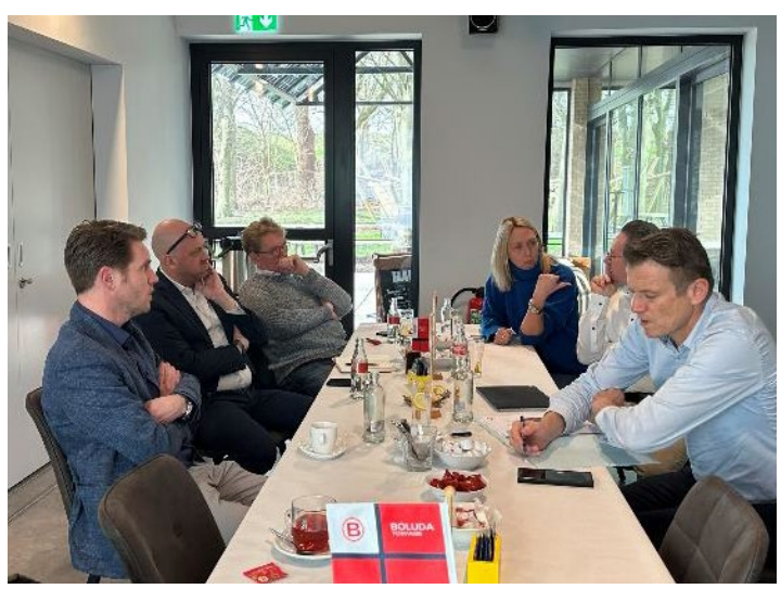
Discussion about the topics and challenges within the maritime sector