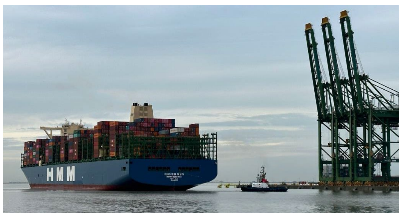
HMM Helsinki assisted by Boluda's VB Eagle in the port of Antwerp